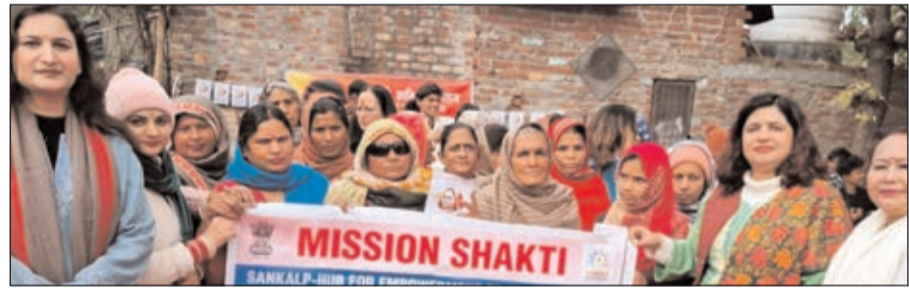
Social Welfare Department officials at an awareness programme.

■ STATE TIMES NEWS JAMMU: Jammu-Mission Shakti SANKALP HEW Social Welfare Department on Wednesday conducted awareness sessions in Village Khanpur block Nagrota and Kalka colony Bahu Fort to empower women and promote gender equality. The initiative was designed to inform the community about the government schemes focused on uplifting and supporting women, with a broader mission of fostering gender equality and strengthening the role of women in society. At the informative session, Mission Shakti's team covered an array of government programs that cater specifically to women's welfare, economic empowerment, safety, and security. Key schemes highlighted