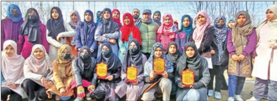
Participating teams posing for a photograph with dignitaries.

■ STATE TIMES NEWS KULGAM: Akhran Volleyball Club emerged as champions of the two-day District Volleyball Championship organised by the Volleyball Association of Kulgam in collaboration with the Volleyball Association of Jammu and Kashmir at the Sports Stadium, Akhran. In the closely contested final, Akhran Volleyball Club defeated Chowgam Volleyball Club by 3-1 sets (25-19, 25-21, 22-25, 25-18) to lift the title trophy. The champi-