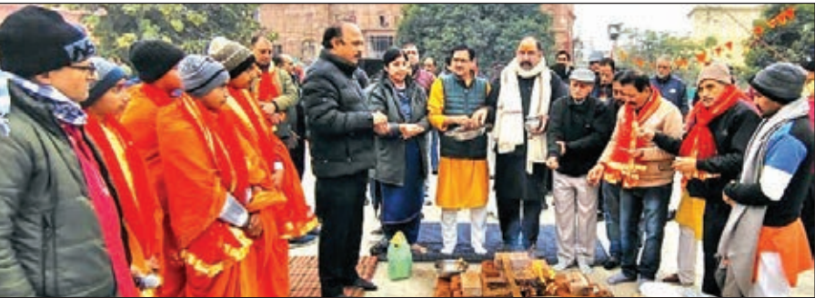
Dignitaries offering Puran Ahuti in Hawan during a programme.

JAMMU: A grand Basti Shah Sammelen was organised at the historic Mubarak Mandi Heritage Complex, Ward No. 1, as part of the celebrations marking 100 years of the Rashtriya Swayamsevak Sangh (RSS). The programme focused on the ideals of Akhand Bharat, social harmony, cultural awareness, and national unity.