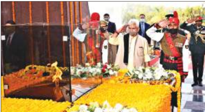
LG Manoj Sinha paying homage to martyrs of 1971 War. (More pics on pg-3)

been a supporter of peace since ancient times and has never adopted the policy of expansionism despite being a super power.