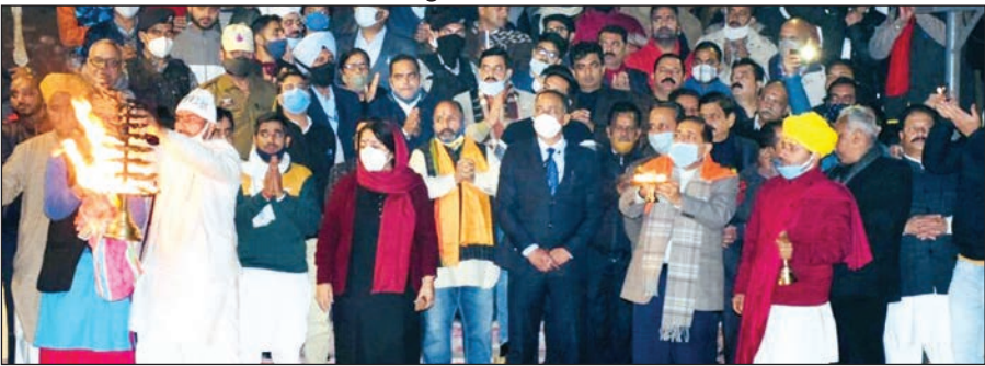
Union Minister Dr Jitendra Singh participating in 'Aarti' at Devika Ghat, Udhampur on Saturday.