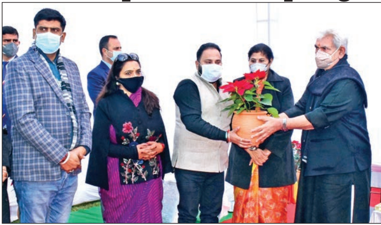
Lt Governor, Manoj Sinha during inauguration of 'Adopt-A-Park' programme.

"We must follow our ancient cultural system which propagates environ-