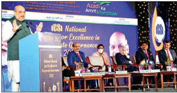
Home Minister Amit Shah speaking at 21st edition of ICSI National Awards ceremony.