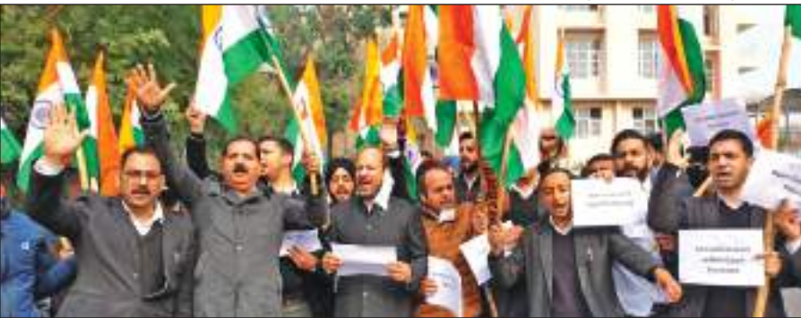
Lawyers raising slogans during a protest at Jammu.