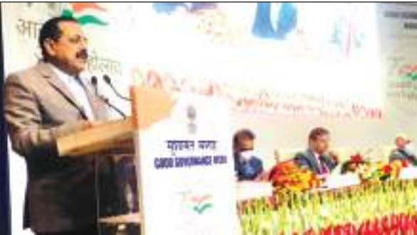
Union Minister Dr Jitendra Singh speaking after inaugurating Good Governance Week campaign 'Prashasan Gaon Ki Aur' at Dr. Ambedkar International Centre, New Delhi on Monday.