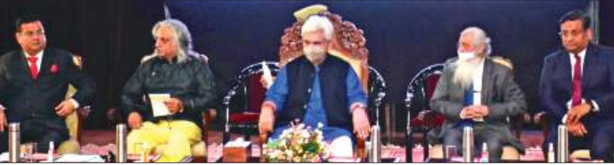
Lt Governor, Manoj Sinha during launch of AICTE's Personal & Institutional Happiness Index App- 'Your One Life-YOL'.