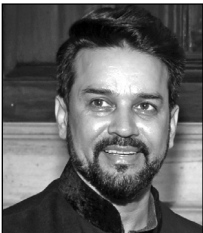
■ ANURAG SINGH THAKUR