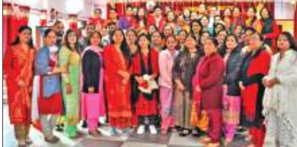
Carmel Convent School, Jammu faculty during Christmas celebration.