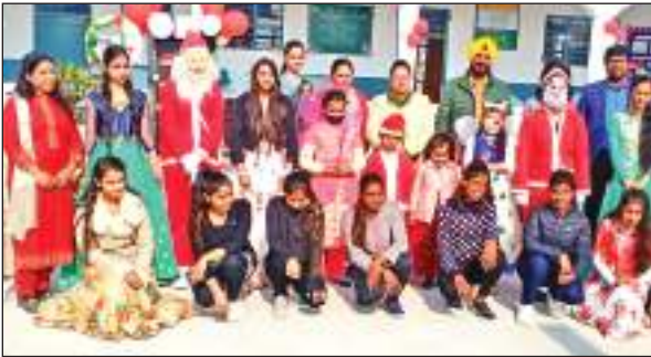
Unique Public Senior Secondary School Gadigarh students and faculty during Christmas celebration.