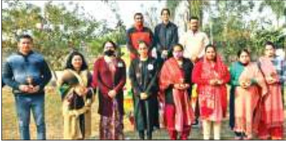
JSS Jammu faculty and participants during Christmas celebration.