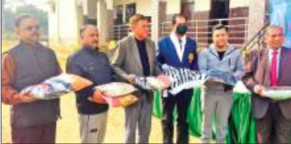
DPS Udhampur faculty donating cloths among needy people.