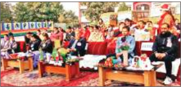
RMPS faculty and management members during Christmas celebration.

corona free new year while also wishing everyone a Merry Christmas. In her vote of thanks,