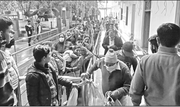
Devotees in queue to pay obeisance at Narsingh Temple.