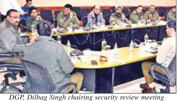
at Srinagar on Friday.

Speaking to the officers, the DGP expressed satisfac-