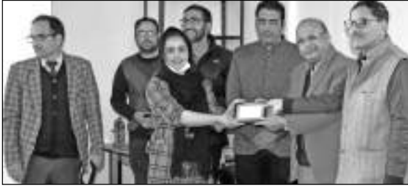
A participant being given trophy during the event.