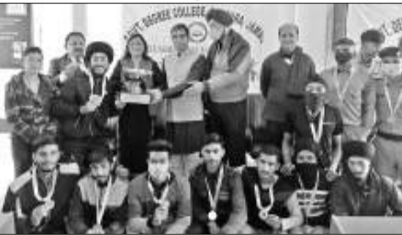
Winner students along with faculty during the event.