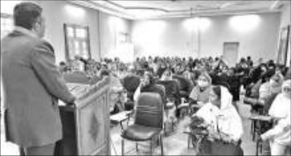
A resource person expressing views during the programme.

■ STATE TIMES NEWS KISHTWAR: District Legal Services Authority Kishtwar, in Collaboration with Mahela Shakti Kendra, today organized a Mega Awareness Programme on "Empowerment of Women." The Programme was organized at Islamia Faridia College of Education and was attended by Secretary District Legal Services Authority Kishtwar, Principal Islamia Faridia College of Education,