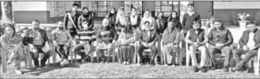
Faculty along with students during the programme.