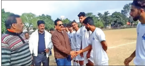
Chief Guest interacting with Footballers at GGM Science College Football ground on Friday.