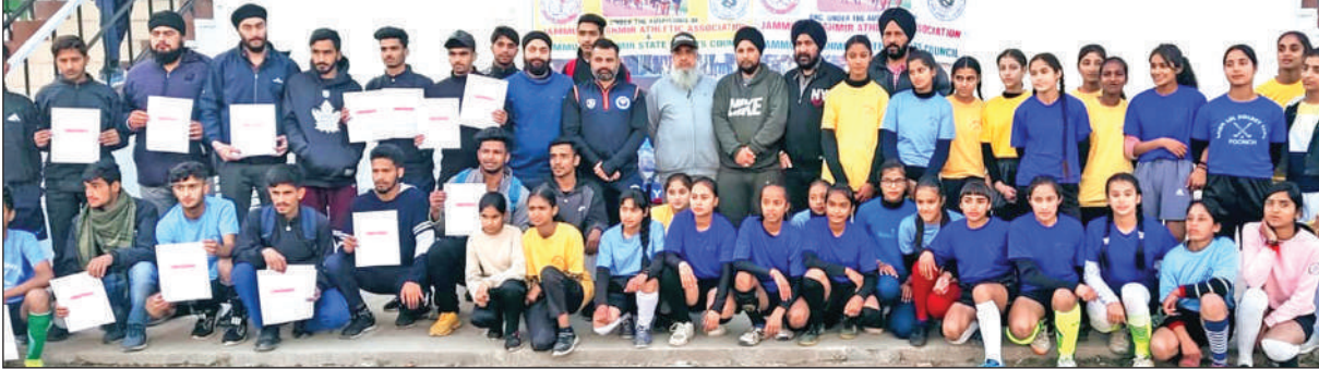
Players posing with officials during closing ceremony of District Poonch Athletic Championship at Poonch.