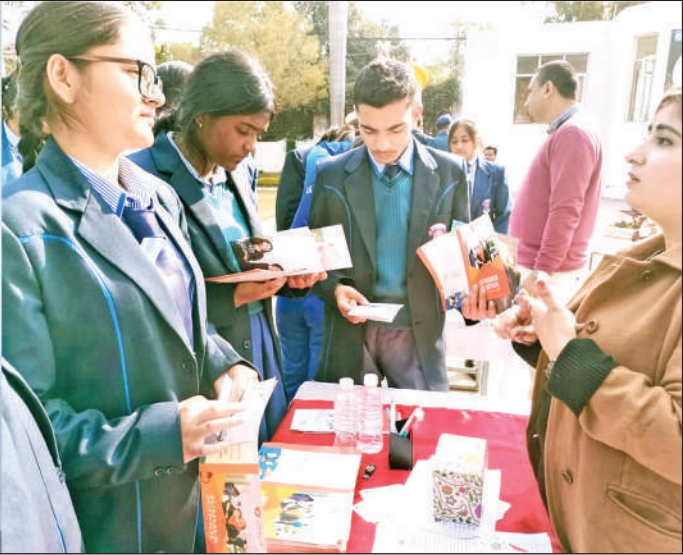
Glimpses of career-counselling fair held in the premises of JK Public School Kunjwani.