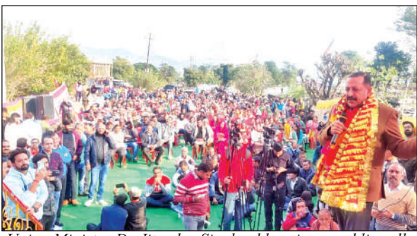
Union Minister Dr Jitendra Singh addressing a public rally of BJP at Udhampur on Saturday.

■ STATE TIMES NEWS UDHAMPUR: Hitting out hard at the opposition party governments in the past, Union Minister Dr Jitendra Singh said here today that Udhampur and other hill regions were neglected because of the appeasement policy followed by successive governments headed by National Conference (NC) and Congress whose priority was vote bank consideration and who made it a point to convey the message that their plans of development were not meant for such districts or regions from where they did not expect such votes.