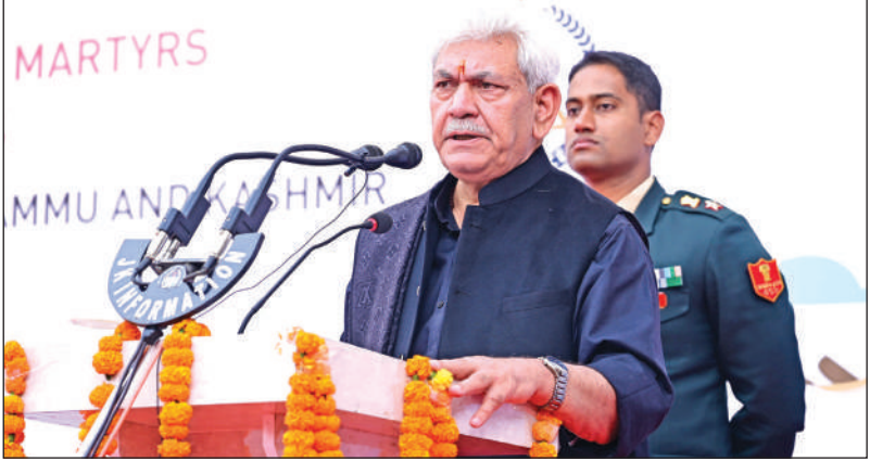
LG Manoj Sinha speaking during an event held at J&K Police Public School, Miran Sahib on Saturday.

■ STATE TIMES NEWS JAMMU: Lieutenant Governor Manoj Sinha on Saturday said his administration is committed to take concrete measures for the welfare of the families of those who laid down their lives fighting terrorism in the Union Territory. Sinha urged society, enlightened citizens, business organisations and corporates to come forward and support the government to create a system which provides ample opportunities to the dependents of the fallen personnel. The Lt Governor was speaking at a function after inaugurating a Digital Skill Development programme for the wards of slain policemen to generate sustainable livelihood in J-K Police Public School here. The initiative under Corporate Social Responsibility (CSR) by Indus Towers Limited is a tribute to bravehearts of Jammu Kashmir Police who made the ultimate sacrifice for the country. "I pay my humble tributes to those immortal heroes who sacrificed their lives in order to promote the lives of others. J-K Police, Army, Central Police Forces have made significant contributions in nation building. Let us all together take a pledge to discharge our duty towards the families of our martyrs and strengthen our resolve to work for