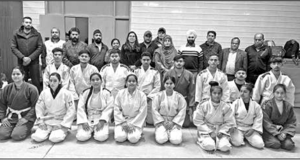
Judo players posing for a photograph with officials.