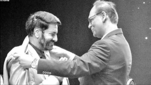
Mahen Seeruttun, Acting Foreign Minister of Republic of Mauritius honouring Padmashree Balwant Thakur.

The festival was inaugurated by the President of the Republic of Mauritius Prithivirajsingh Roopun in the gracious presence of Mr. Avinash Teeluck Minister of Arts and Cultural Heritage and the High Commissioner of India to Mauritius. K. Nandini Singla.