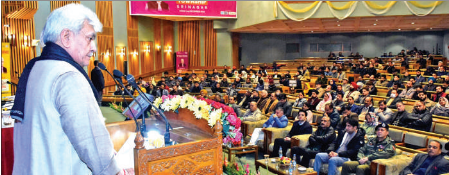
LG Manoj Sinha speaking after laying foundation stone of Satellite Township & Housing Colony at Srinagar on Wednesday.

SRINAGAR: Highlighting the efforts of the government to rejuvenate the urban landscape in the Union Territory, Lieutenant Governor Manoj Sinha on Wednesday said, cities and towns of Jammu and Kashmir are experiencing a transformational urbanism that has been achieved through excellence in infrastructure planning and execution and stimulated local development.