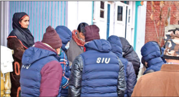
SIU team carrying out search in a premises at Anantnag.

■ STATE TIMES NEWS SRINAGAR: The Special Investigation Unit (SIU) of Jammu and Kashmir Police on Wednesday conducted searches at two locations in connection with a case regis-