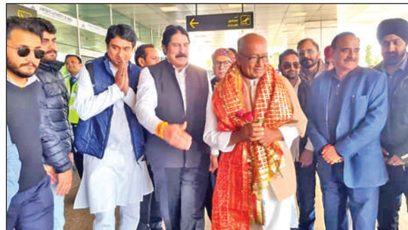
Senior Congress leader Digvijaya Singh being welcomed by party leaders on his arrival at Jammu airport on Wednesday.

■ STATE TIMES NEWS JAMMU: Senior Congress leader and former Madhya Pradesh chief minister Digvijaya Singh arrived here on Wednesday for a two-day visit to oversee preparations for the party's 'Bharat Jodo Yatra' march in Jammu and Kashmir.