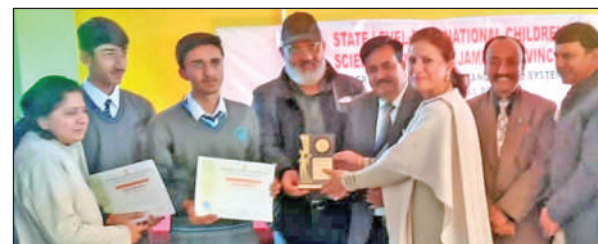
Selected students and other dignitaries at a programme.