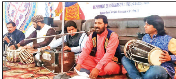
DIPR artists presenting cultural programme at Jammu.