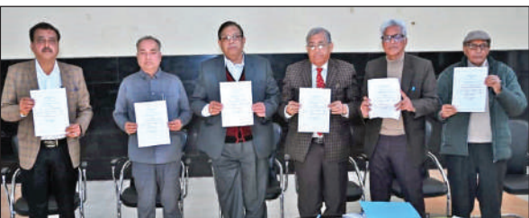
JCMS members during a meeting at Jammu.