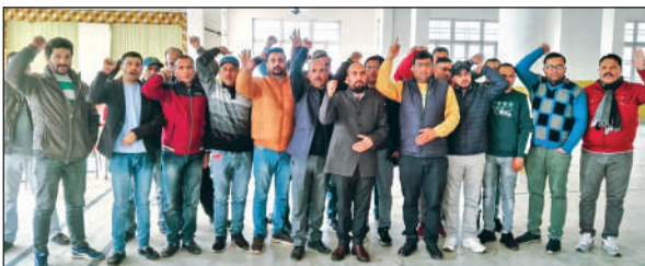
NPS employees during a meeting at Jammu.