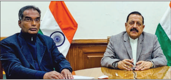
Dr Jitendra Singh addressing media in the presence of Union Secretary, Department of Science & Technology, Dr S. Chandrasekhar at New Delhi.

■ STATE TIMES NEWS NEW DELHI: India has jumped from 7th to 3rd global ranking in scientific publications. This was disclosed here on Sunday by Union Minister, Dr Jitendra Singh while addressing the media in the presence of Union Secretary Department of Science & Technology (DST) Dr S. Chandrasekhar. Lauding the consistent efforts of India's scientific fraternity, Dr Jitendra gave all credit to an enabling milieu and freedom of working provided by Prime Minister Narendra Modi. He said, the very fact that such quantum leaps in our scientific pursuits are happening only in the last few years is a testimony to the push given by PM Modi both in terms of the ease of policy as well as his personal indulgence and prioritisation. Dr Jitendra informed that as per the National Science Foundation (NSF)'s Science & Engineering Indicators 2022 report of the United