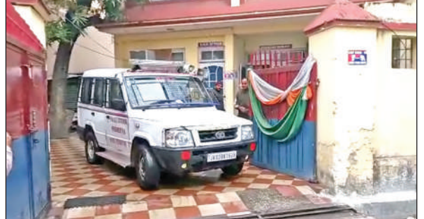
Files charge-sheet against 3 terror-funding Kashmir based accused

■ STATE TIMES NEWS JAMMU: The National Investigation Agency (NIA) on Friday conducted searches at 14 locations in different districts in a case related to terror activities of various proscribed outfits in Jammu and Kashmir, an official said. The raids were conducted in Jammu, Kulgam (south Kashmir), Pulwama, Anantnag and Sopore in (north Kashmir's Baramulla), a spokesperson of the federal agency said. The searches were carried out in connection with a case which was suo-moto registered on June 21 by the NIA Police Station in Jammu. "The case pertains to the criminal conspiracy for carrying out terrorist and subversive activities hatched by the cadres and