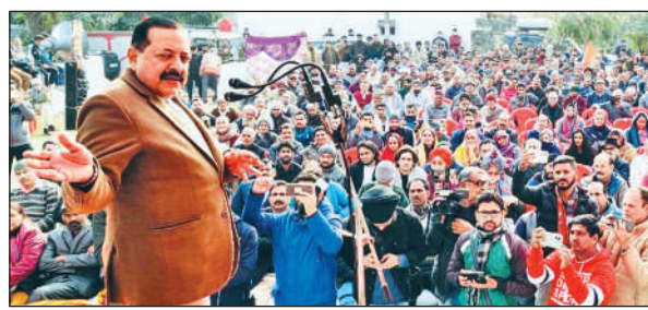
Union Minister Dr Jitendra Singh addressing public rally at Jalota area of district Kathua on Saturday.