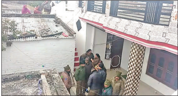
NIA team carrying out raid in a house in Jammu District.

According to NIA handout, the case relates to terror activities of chiefs/members of proscribed terrorist organizations, such as Khalistan Liberation Force, Babbar Khalsa International, International Sikh Youth Federation etc. Such activities include smuggling of terrorist hardware, such as arms, ammunition explosive, IEDs etc. across international borders, for use by operatives/members of terror outfits and organized criminal