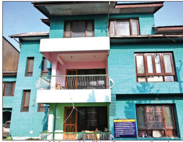
A property of JeI seized by SIA in Srinagar on Saturday.