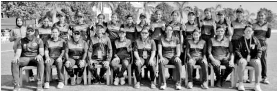
Winner team posing for a photograph with officials.