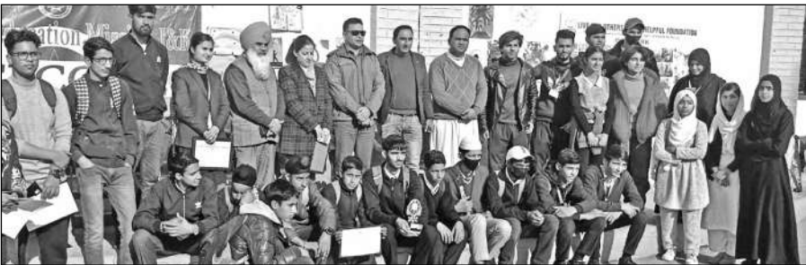
LFO-BHF members and other dignitaries and students during a programme.