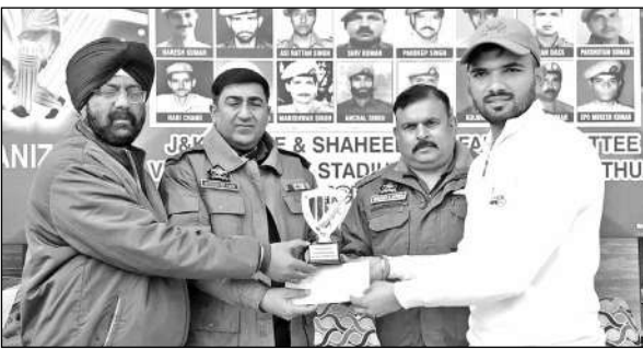
Man of the Match player receiving award.