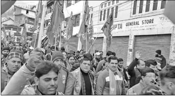
BJP workers taking out rally at Bhadarwah.