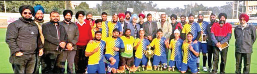
Winner team posing for a photograph with dignitaries.