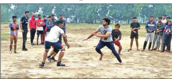
A Kabaddi match in progress.