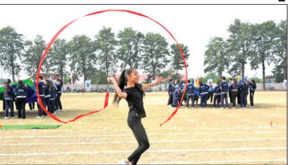
A student presenting aerobic activity during Annual Sports Day at Heritage School, Jammu.