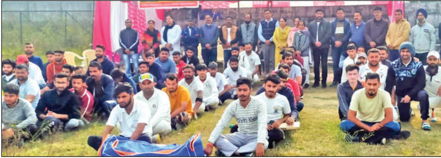
Participating players posing for a photograph with Chief Guest and other dignitaries at Bishnah.