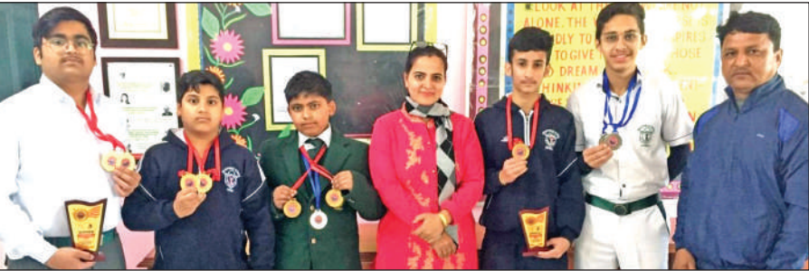
DPS Jammu faculty members posing for a photograph with winner students.