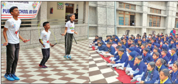
Rope Skippers displaying techniques of Rope Skipping during a workshop at APS BD Bari.