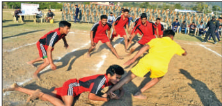
A Kabaddi match in progress at Lam Play Ground in Nowshera.

The tournament was played on a league cum knock-out basis with the final being played between Dr Ambedkar Team and Team Laroka. Dr Ambedkar Team emerged victorious and lifted the trophy.