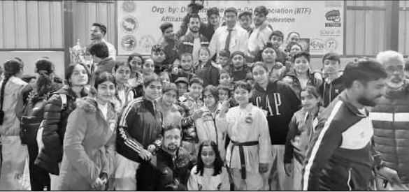
Medal winner players posing with dignitaries.