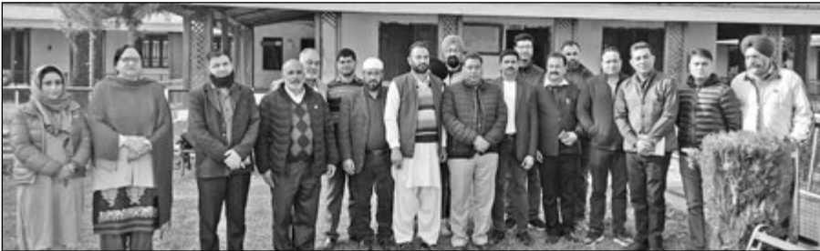
Plus Two Lecturer's Forum members after the meeting.