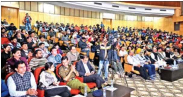
LG Manoj Sinha speaking during 'My Town, My Pride' Programme in Jammu on Tuesday.