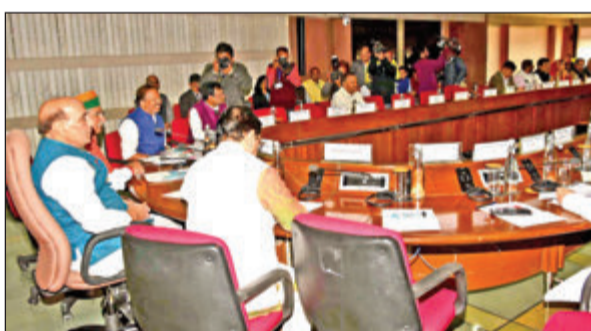
All Party Meeting going on under the chairmanship of Union Minister for Defence, Rajnath Singh in New Delhi.

While the BJP demanded passage of women reservation bill, the Shiv Sena's Shinde faction wanted the population control bill be cleared during the winter session starting from