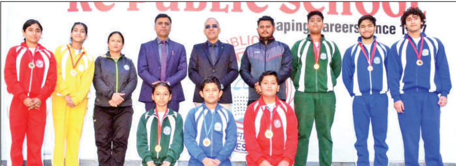
Selected swimmers of KCPS posing with faculty members.