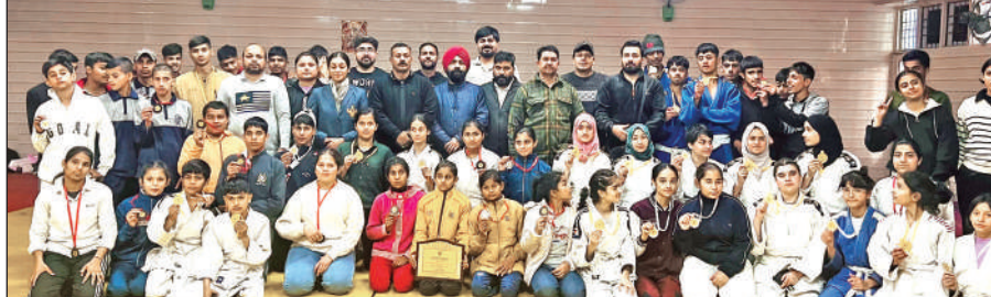
Medal winner players posing for a photograph with dignitaries.