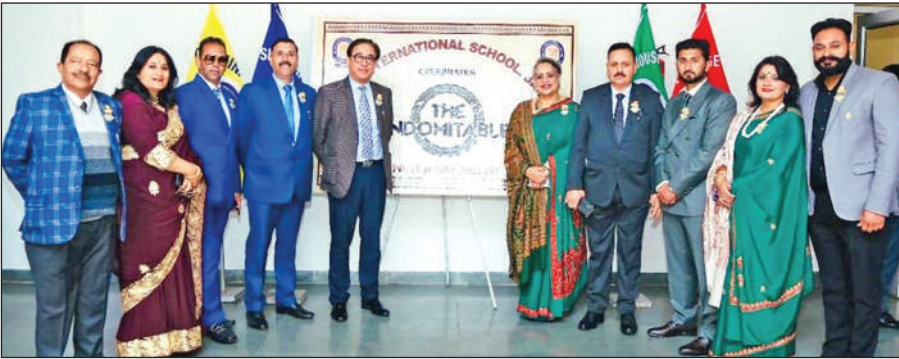
DIS faculty members and other dignitaries at Annual Day function.