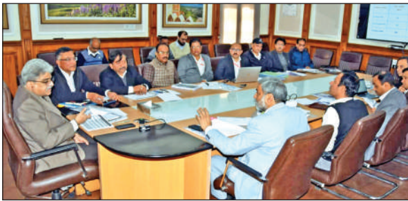
Chief Secretary, Atal Dulloo chairing a meeting in Jammu.

The meetings were attended by Additional Chief Secretary (ACS), Jal Shakti Department; Principal Secretary, Forests; Principal Secretary, PWD; Principal Secretary, PDD; Divisional Commissioner, Jammu; Secretary, Revenue; Secretary, DMRR&R;