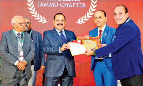
Union Minister Dr Jitendra Singh handing over national level Hospital Academy Excellence Awards to some of the country's distinguished doctors specialising in hospital administration.

■ STATE TIMES NEWS NEW DELHI: Union Minister Dr Jitendra Singh, who is also a Professor of Medicine and a renowned Diabetologist, said here that the role of Hospital Administrators is critical as coordinators of medical management among different specialities and different streams of healthcare practice. India has moved from sectoral and segmented approach of health service delivery to a comprehensive need-based healthcare service, said Dr Jitendra Singh while handing over the national level Hospital Academy Excellence Awards