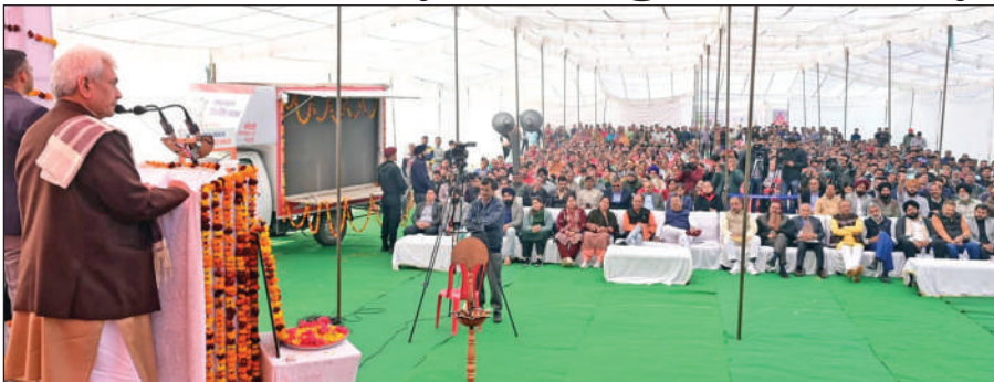
Lt Governor Manoj Sinha addressing a gathering at Mahal Shah Panchayat, Samba.

tive efforts of Administration, elected representatives and the people have enabled better education facilities, better health facilities, cleanliness in villages, better road and communication connectivity in rural areas to realize economic development and bridge the rural-urban gap, he said.