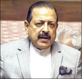
Union Minister Dr. Jitendra Singh speaking in the Rajya Sabha on Thursday.

dates-respondents herein, they shall be entitled to all consequential benefits minus the monetary benefit with effect from 16th September, 2013, i.e., when SWP No.1953/2013 came to be filed. They, however, shall be entitled to monetary benefits with effect from 1st April, 2024. While concluding the selection process, the petitioners-authorities are expected to take a sympathetic view as the candidates-respondents herein must have crossed the age bar and have no scope to get another job as the posts were advertised in the year 2005 as also that the adhoc Warders have already been regularized by the authorities, besides the posts have also been increased to many fold.