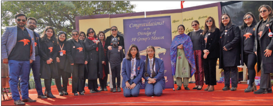
Students an faculty members during a celebration at Jammu.

The carnival also embraced diversity through a variety of dance performances, encompassing hip-hop and theme-based dances. These dynamic displays of artistry brought