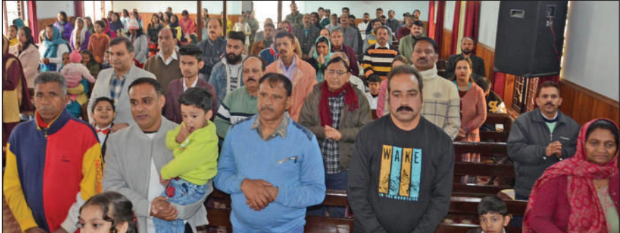
Christian community visiting St. Peter's Catholic Church, Prem Nagar on Christmas.

The morning service on 25th December started at 11 AM where again hundreds of people came to participate and prayed for peace and blessings of Jesus. The festival of Christmas is celebrated every year with lot of religious fervour, joy, carolling and sharing.