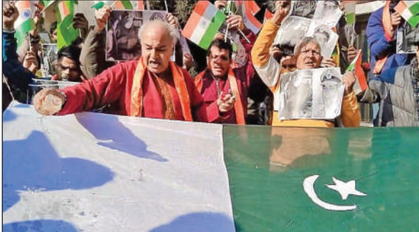
DFSS activists buring Pakistan Flag during a protest.

He stated that the time was ripe for all the parties to be united for defeating the nefar-