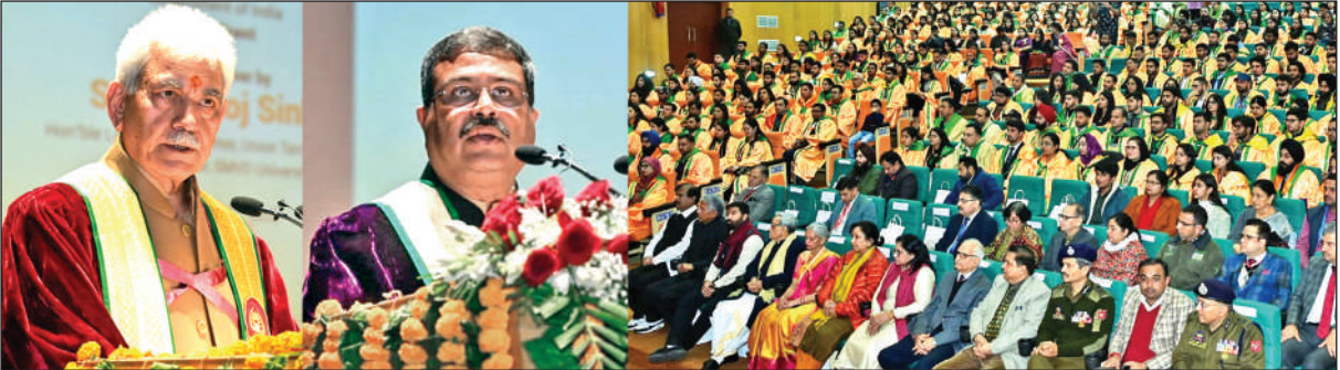
LG Manoj Sinha and Union Education Minister Dharmendra Pradhan addressing the 9th convocation of Shri Mata Vaishno Devi University, in Katra on Thursday.