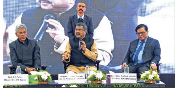
Union Minister of Education Dharmendra Pradhan speaking at an event at IIM Jammu.

JAMMU: The Indian Institute of Management Jammu (IIM) Jammu hosted Dharmendra Pradhan, Minister of Education and Skill Development & Entrepreneurship, Govt. of India, for a momentous visit that included a comprehensive review of ongoing construction activities. This visit not only underscored the institute's steadfast commitment to academic excellence and innovation but also aligned seamlessly with the broader goals of national progress under the visionary initiative, "Viksit