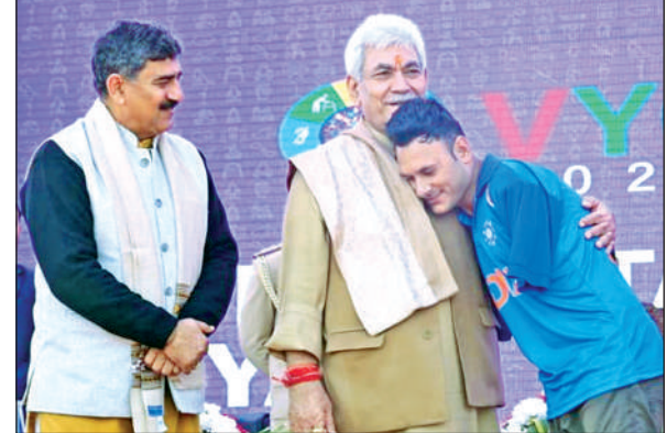
LG Manoj Sinha hugging a Divyangjan after inaugurating Purple Fest in Jammu on Thursday.

JAMMU: Stating that 384 Divyangjan were provided government jobs during last financial year and reservation has increased from 3 percent to 4 percent, Lieutenant Governor Manoj Sinha on Thursday announced that a legal framework will be prepared to ensure employment opportunities to Divyangjan in private sector. "The posts whether under PSC or JKSSB will be filled within 6 months", the Lieutenant Governor said while inaugurating, along with Union Minister of Social Justice and Empowerment Dr. Virendra Kumar, J&K's first festival of Inclusion, Purple Fest, which aims to showcase a kaleidoscope of