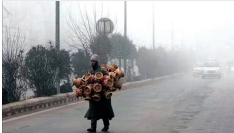
A vendor selling 'Kangris', the traditional Kashmiri firepots, crosses a road amid dense fog in Srinagar on Friday.

The visibility in Srinagar city and its adjoining areas was below 50 metres for the third day due to dense fog. The transport department has