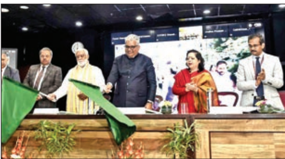
Union Minister for Forest and Environment, Bhupender Yadav virtually flagging off vehicles from Srinagar.

Pertinently, the innovative endeavor was part of e-governance initiatives being introduced for promoting Ease of Doing Business, transparen-