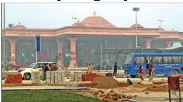
A view of Shri Ram International Airport ahead of inauguration by PM Narendra Modi on December 30.

"The prime minister is expected to reach Ayodhya airport somewhere around 10:45 am. After landing at the airport, he will move straight to Ayodhya railway station where he will inaugurate the redeveloped railway