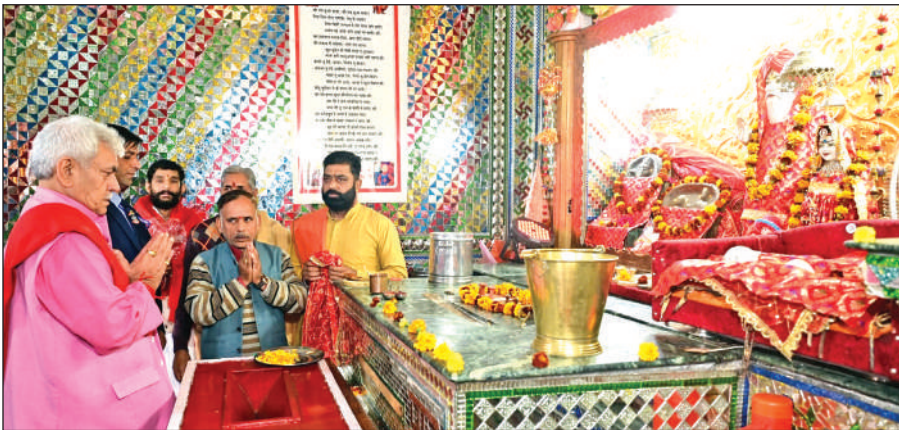
Lt Governor Manoj Sinha paying obeisance to Baba Jitto at his Samadhi in Jhiri Village.

"The simplicity of Baba Jitto, his vision as an enlightened soul, his life's work as a farmer is an integral part of our spiritual-cultural ethos. His sacrifice for social justice and equality has been so profound that it has influenced many generations across the country," the Lt Governor said.