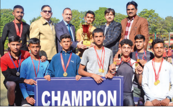
Winner team receiving trophy from the chief guest.

■ STATE TIMES NEWS JAMMU: The hosts MHAC School Nagbani bagged the overall championship trophy in the three-day Cluster level DAV National Sports meet held in three age groups of under-14, under-17 and under-19 here. To claim the title trophy, MHAC Nagbani secured seven gold, three silver and bronze medal. Overall second place went to MHS DAV Centre Akhnoor with