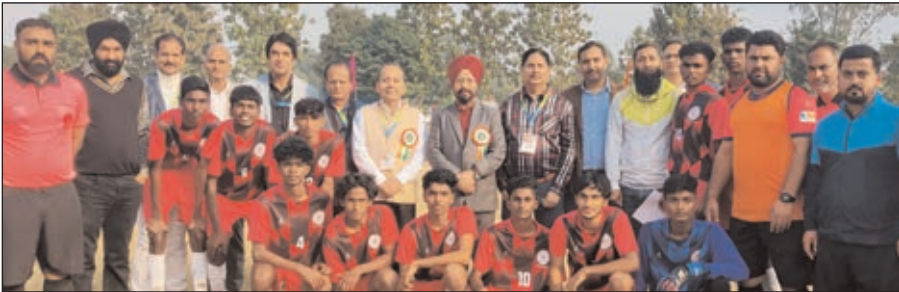
Chief Guest posing for a participating team and other dignitaries.