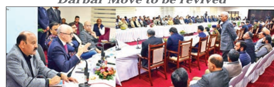
Chief Minister Omar Abdullah chairing a meeting at Jammu on Wednesday