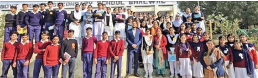
GHSS Kot Bhalwal students posing with faculty members.