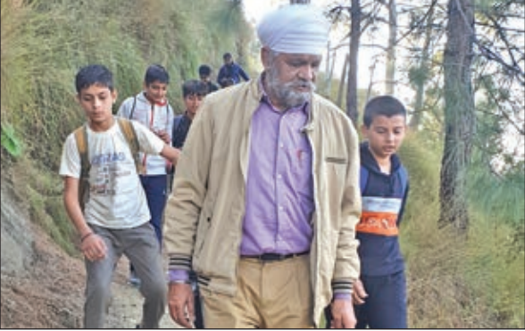
Jammu Adventure Sports Association member with students during terkking.

■ STATE TIMES NEWS JAMMU: Jammu Adventure Sports Association (JASA) committed to environmental and community welfare marked International Mountain day by organizing a trekking programme was organized in the world famous Ramsar wetland, Mansar lake area in Jammu. The 10 kms trek from Mahor Garh Fort to Mansar was completed in 4 hours time. The event aimed at raising awareness about the importance of Mountain ecosystems and wetland conservation by way of discussion and