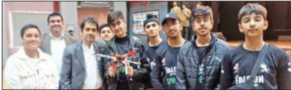
Booth and Innovation Award.