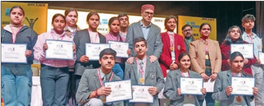
CM Omar Abdullah felicitating top-performing students of St. Xavier Convent School.