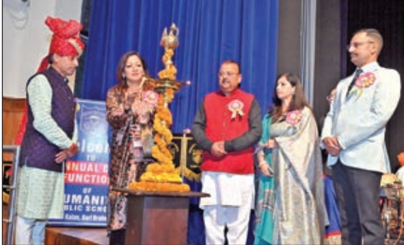
A dignitary lighting ceremonial lamp.

The evening commenced with the ceremonial lighting of the lamp by the Chief Guest and other dignitaries, including the Chairperson