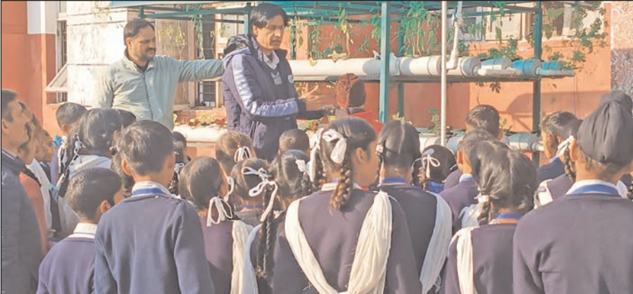
KVK scientist educating students at Reasi.