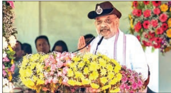
Home Minister Amit Shah addressing gathering at 61st Raising Day celebrations of SSB in Siliguri on Friday.

STATE TIMES NEWS SILIGURI: Union Home Minister Amit Shah on Friday lauded the Sashastra Seema Bal (SSB) for its pivotal role in securing the country's borders with friendly nations such as Nepal and Bhutan, combating Naxalism in Bihar and Jharkhand, and curbing illegal activities.