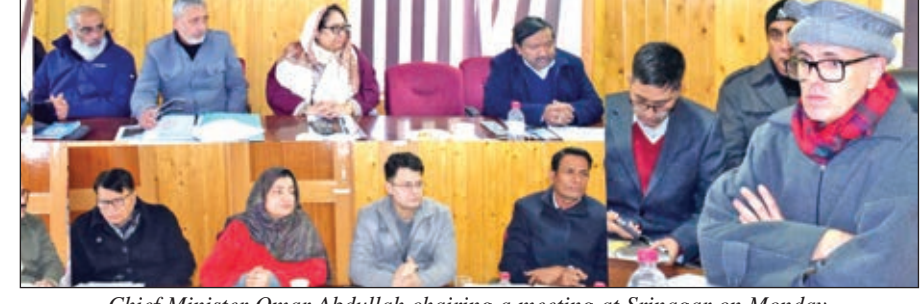
Chief Minister Omar Abdullah chairing a meeting at Srinagar on Monday.

Minister discussed a comprehensive strategy to manage peak electricity demand and directed officials to maintain efficiency in ensuring a reliable power supply during the harsh winter season.