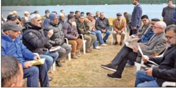
Chief Minister Omar Abdullah listening to people's grievances during public outreach programme at Srinagar.

"Our endeavour is to minimise the power cuts, and ensure water supply even as