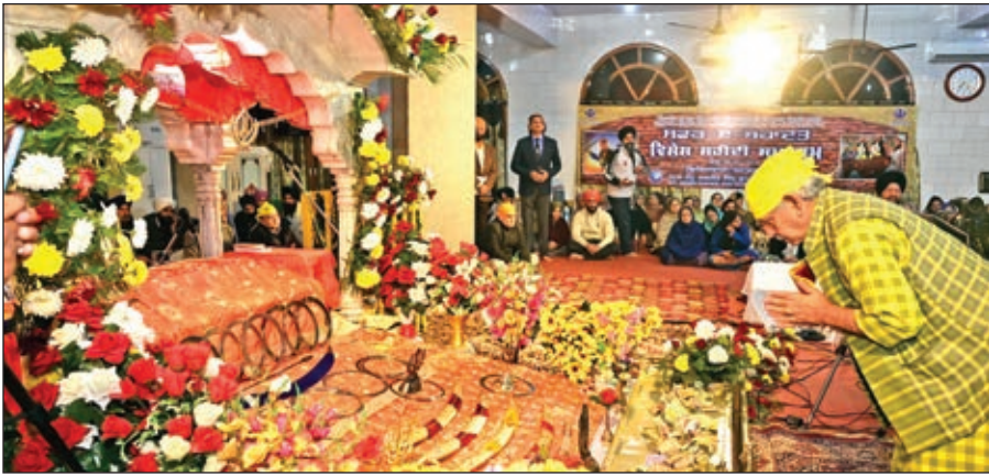
LG Manoj Sinha paying obeisance at Gurdwara Digiana Ashram on the occasion of Veer Baal Diwas on Thursday.