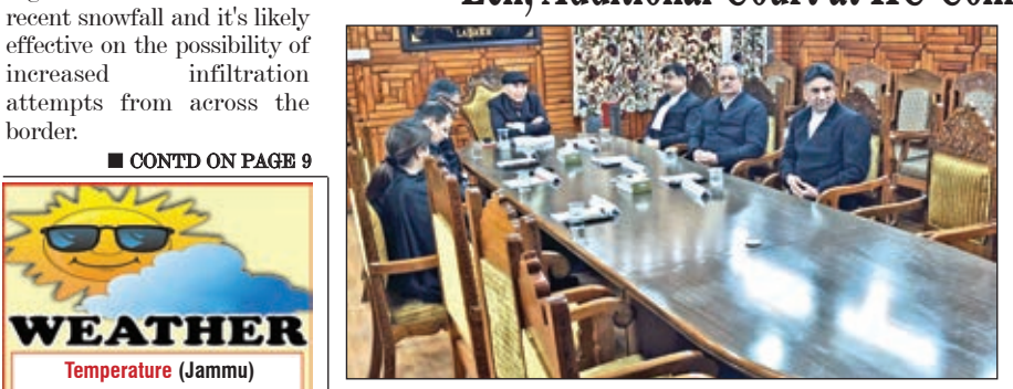
Chief Justice Tashi Rabstan virtually inaugurating State-ofthe-Art High Court Guest House at Melongthang Leh, Additional Court at High Court Complex Srinagar.