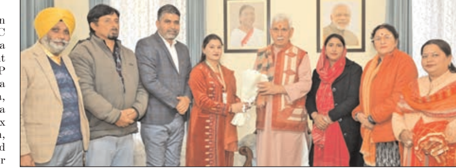
BJP leaders calling on LG Manoj Sinha in Jammu.

The delegation discussed _{\mathrm{the}} Lieutenant \operatorname{with} Governor various public important issuesof Nowshera constituency and problems faces by general public after formation of new Government and the problems being faced by the