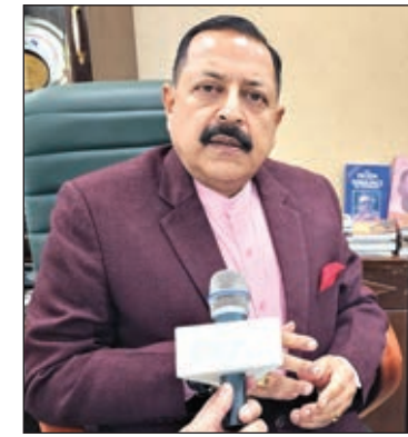
Union Minister Dr. Jitendra Singh in an exclusive year-end interview with a news agency at New Delhi on Monday.

The Minister said that the Department of Pensions and Pensioners' Welfare (DoPPW) under his ministry actively promoted use of digital life certificates among the pensioners.