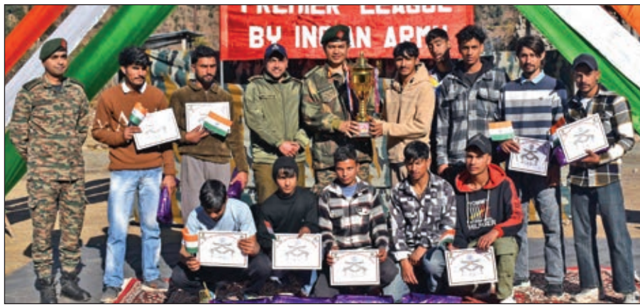
Army officer presenting trophy to winner team.