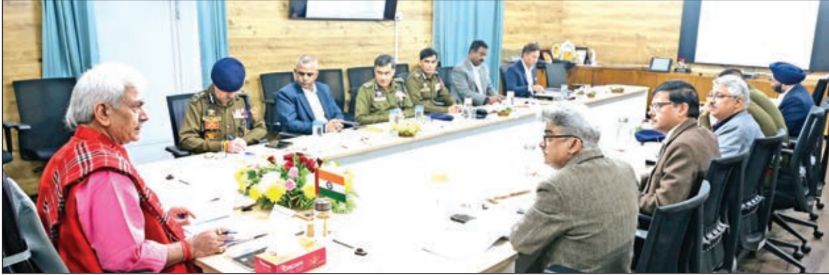
LG Manoj Sinha chairing meeting to review the functioning of Home Department in Jammu on Tuesday.