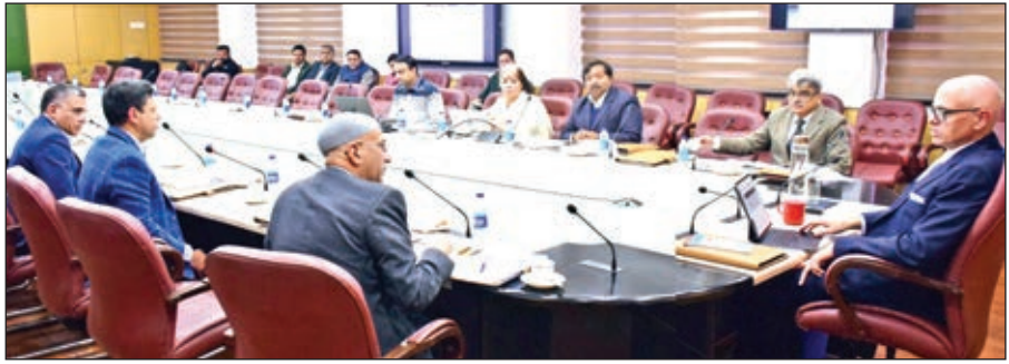
CM Omar Abdullah chairing review meeting of GAD in Jammu on Tuesday.