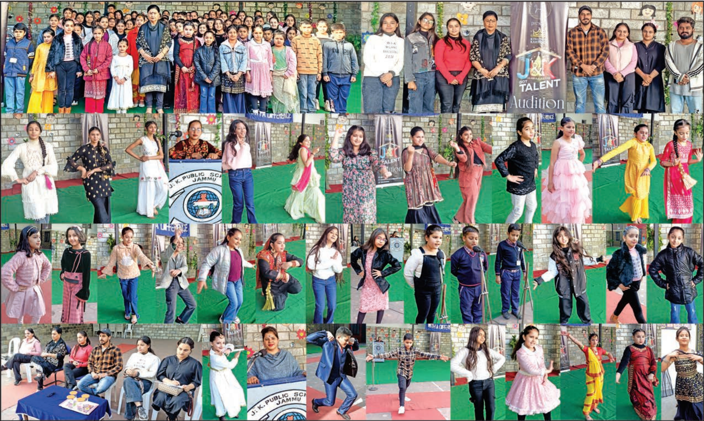
Glimpses of INARA's 'J&K got talent-2024' audition at JK Public School Panjtirthi.