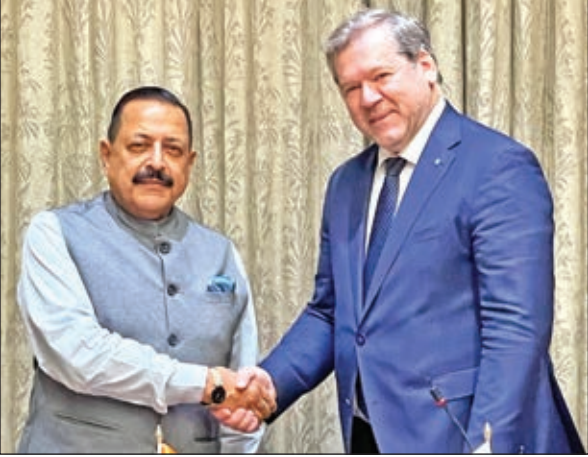
Slovenia Minister for Higher Education, Science and Innovation, Dr. Igor Papi? calling on Union Minister Dr. Jitendra Singh at New Delhi on Thursday. Dr. Jitendra Singh and Slovenian Minister Dr. Igor Papi? met today at Parliament House to finalize the Programme of Cooperation (PoC) for 2024-2029. The meeting emphasized expanding joint research in transformative areas, including hydrogen

■ STATE TIMES NEWS NEW DELHI: "We are happy to deepen our ties with Slovenia as we finalize the Programme of Cooperation (PoC) for five years, that is, 2024-2029. This initiative will open avenues for research and foster networks among scientists of both nations," said Union Minister, Dr. Jitendra Singh during his meeting with Slovenian Minister for Higher Education, Science and Innovation, Dr. Igor Papi? here on Thursday. The dialogue underscored both nations' commitment to strengthening their scientific and technological collaboration. India and Slovenia are set to embark on an ambitious new phase of scientific collaboration, as Union Minister