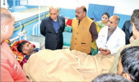
Dy CM Surinder Choudhary enquiring condition of accident victims at GMC Jammu.

■ STATE TIMES NEWS JAMMU: Jammu and Kashmir Deputy Chief Minister Surinder Choudhary and two senior BJP leaders on Thursday visited the Government Medical College in Jammu to check on the patients who suffered injuries in a fatal road accident in Kishtwar district.